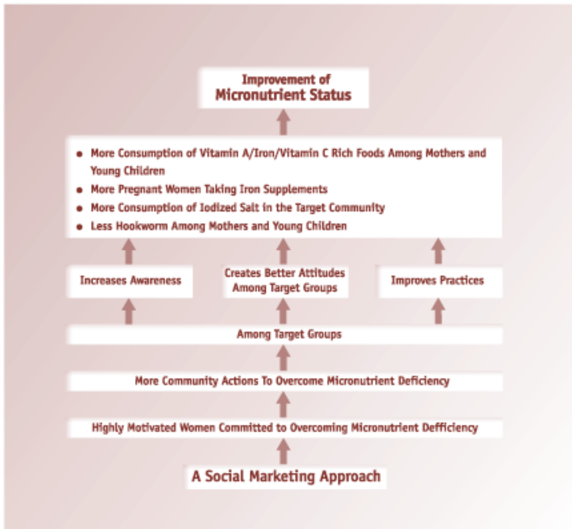
Figure 1. A Conceptual Framework to Guide the Project

women leaders in participatory and problem-solving methods for the purpose of developing community-based interventions and using social marketing techniques to promote and support changes in behaviors relative to the three micronutrients. Figure 1 is the conceptual framework that guided the project's planning and implementation.