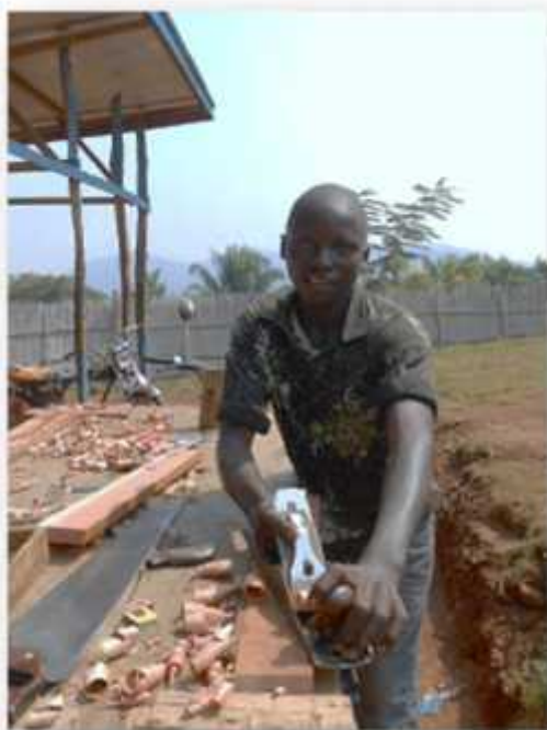
TFV beneficiary in Mahagi, DRC.