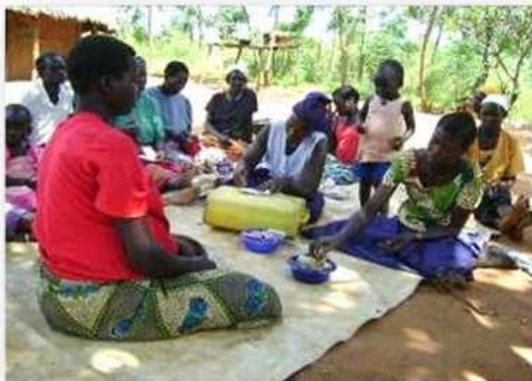
Members of Lapit pe Kun VSLA group in Kitgum district, Uganda during a loan disbursement in one of their saving days.

The ICRW team of evaluators, including the local consultants hired in each country, were neutral parties with complete independence in regard to their interests in evaluation findings. However, at times during the fieldwork in DRC, additional local language skills were required to communicate with victims in their own language, and these skills were available only among the TFV staff. This may have produced a social desirability effect, limiting the degree to which respondents felt they could express their true opinions. However, based on the candid and often critical remarks provided through these translations, and the high degree of professionalism demonstrated by the TFV field staff, the evaluation team is confident that this did not compromise independence nor provide any undue influence on victims' comfort in responding honestly.