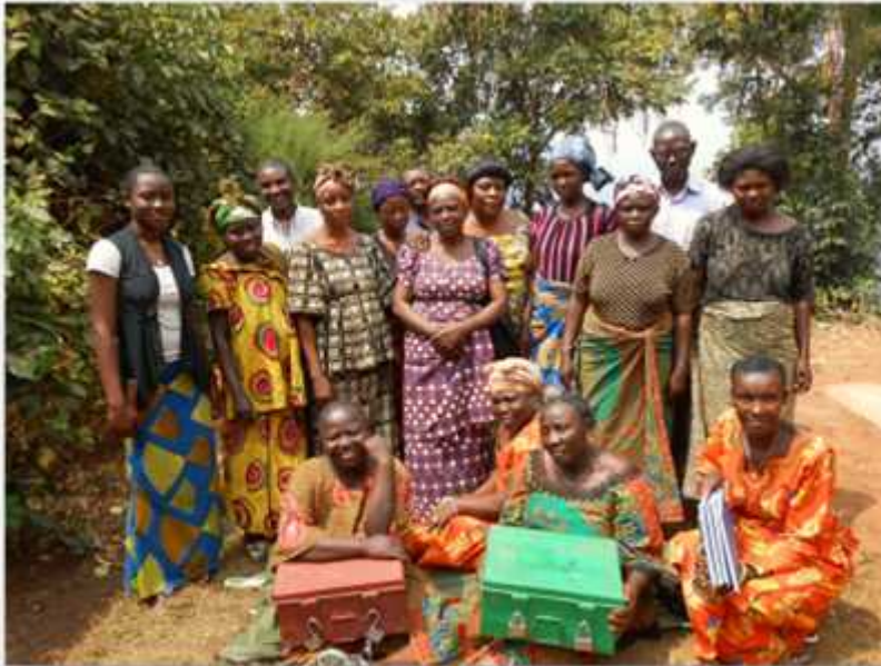
TFV beneficiaries at a MUSO in S. Kivu with TFV partner KAF in Bagira, DRC.

As the TFV moves toward putting its new strategic plan into action, it will be important to prioritize the documentation of the impact of these projects, assessing and replicating effective models, and scaling up to reach even more of the many thousands of victims who are still in need of assistance.