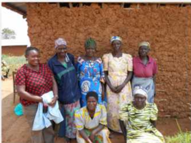
TFV beneficiaries from the community reconciliation project in eastern DRC, Noyo Pacifique de Mamans.

This evaluation provides evidence of the great strides made by the TFV-supported projects in the name of assistance to victims under the jurisdiction of the ICC. As the TFV moves toward putting its new strategic plan into action, it will be important to prioritize the documentation of the impact of these projects, assessing and replicating effective models, and scaling up to reach even more of the many thousands of victims who are still in need of assistance.