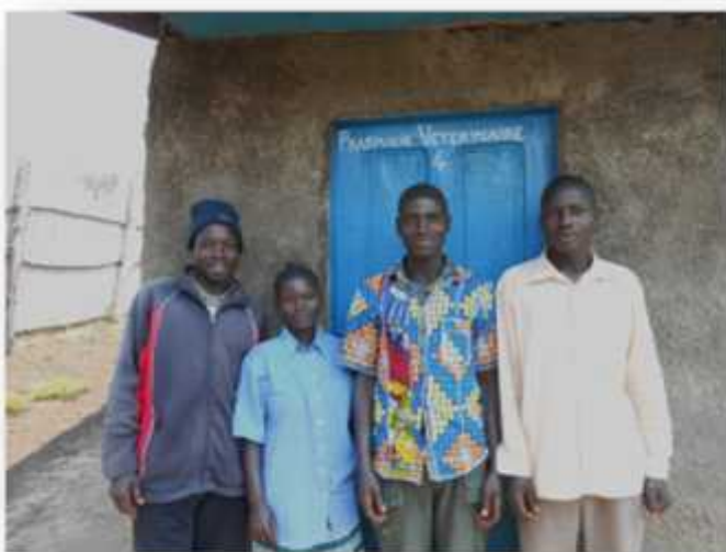
TFV beneficiaries in the veterinary medicine vocational training track, eastern DRC.