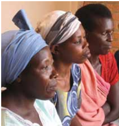
Participants of the Polyclinic of Hope Care and Treatment Project.