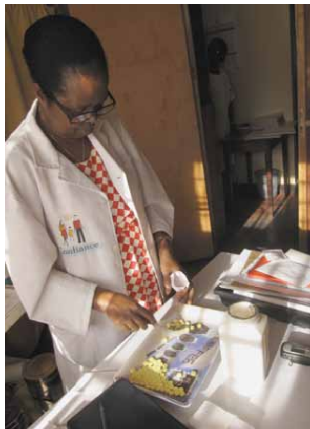
Polyclinic of Hope pharmacist preparing drug therapy.

PoH CTP uses a holistic, comprehensive approach to address the various needs of women GBV survivors. The project recognizes that women's experiences as a result of the genocide include violence, trauma, poverty, ill health, and poor nutrition. It also recognizes that a range of health and socioeconomic factors serve as barriers to HIV prevention, care, and treatment. Therefore, the project provides a package of services to meet the multiple and interlinked needs of women and their families. It has also been designed to identify needs on an ongoing basis through formal participant feedback and informal feedback from